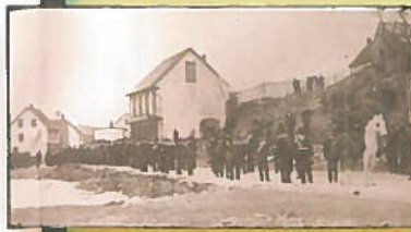
Old Medical Hall